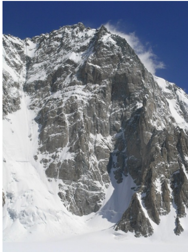
Saser Kangri II, India