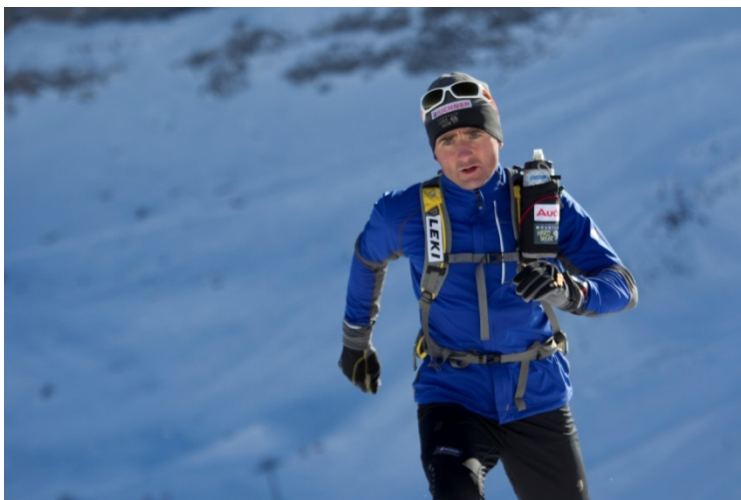
Ueli Steck trains for the big peaks.

Spring Training: The Beginning - As usual, renowned speed climber Ueli Steck is up to something big. This time, though, the Swiss Machine is quite literally taking his fast and light alpine approach to new heights. Undertaking a “spring training” regimen in the high mountains of Nepal, Ueli has spent several weeks preparing and acclimating, including two warm-up climbs on the 6000m peaks of Lobuche and Cholatse. With light and fast as his trademark, Ueli now sets his sights on the taller peaks of the Himalaya.