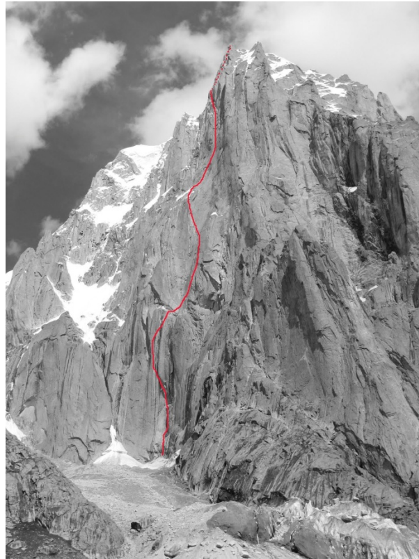
Goodman & Meinen's planned route for K7 West, Pakistan

an alpine style 1 st ascent of the 6200m Southwest Pillar of K7 West. The peak, located in the Charakusa Valley, has three substantial established routes, yet none have continued to the summit of the spire. In a light, fast and committed style, Pat and team will attempt the pillar via the unclimbed west face. The plan is to spend 4 days on the route, carrying only lightweight bivy gear and alternating leads in blocks. The group will acclimatize on many smaller granite pillars in the valley before making their attempt at the main objective. This expedition received two grant awards: the Copp-Dash Inspire Award and a Shipton-Tillman award.