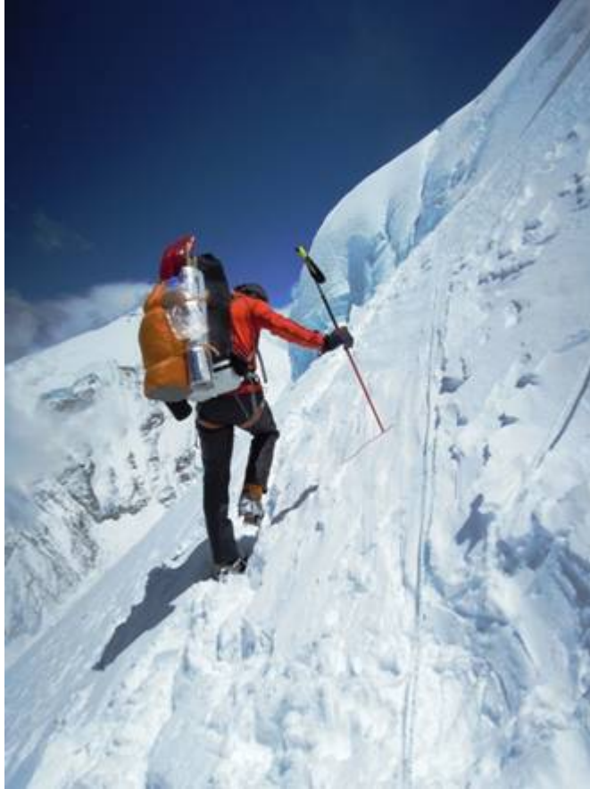
Ueli surveying the climbing conditions on Cho Oyu